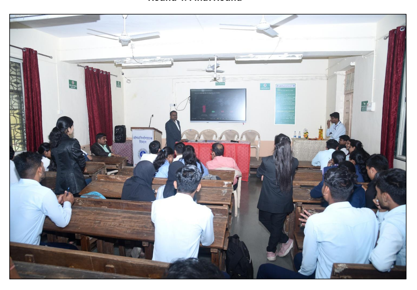
Feedback by Participants