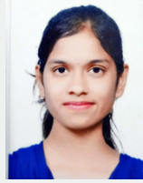
Jangale Komal Sanjivan Percentage: 81.00%